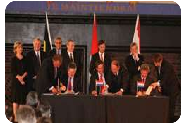
2008: Treaty establishing the 'Benelux Union'