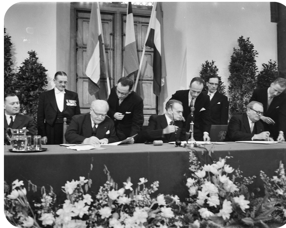
1958: Treaty establishing the 'Benelux Economic Union'