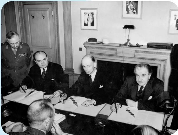
1944: Customs Union + common external tariff between NL, BE and LU